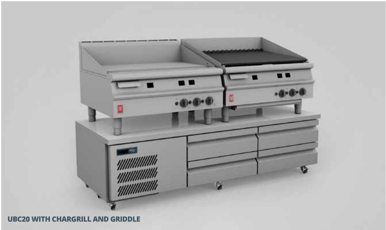
UBC20 WITH CHARGRILL AND GRIDDLE