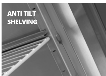
ANTI TILT SHELVING